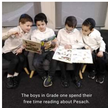
The boys in Grade one spend their free time reading about Pesach.

Grade 5 students were rewarded with a trip to Zone Bowling. The students have been working to gain points by applying themselves in the following areas over the past week: