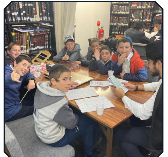
Learning never ends